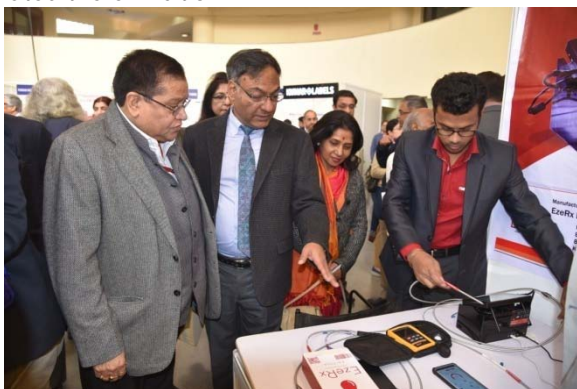
Dignitaries saw the live demonstration of technologies and interacted with innovators of the technologies.