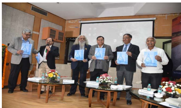
Technology Vision 2035: Technology Roadmap on Water Sector released by the dignitaries